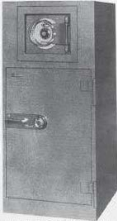
MODEL NO. SHOWN 3020-13E