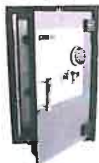
(See back of card)