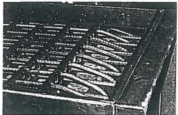
An impressive steel grid forms just one of the many lines of defense in the body build-up completely shrouding the main dense monolithic core of aluminum corund casting.

MANUFACTURED IN SWEDEN BY THE JOHN TANN SECURITY GROUP.