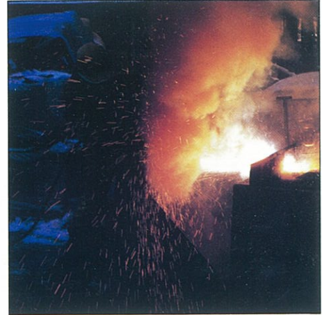
SLS Thermic Lance Testing

The Thermic Lance resistance of this unit is at least 12 times greater than that of any Bankers quality safe currently being manufactured.