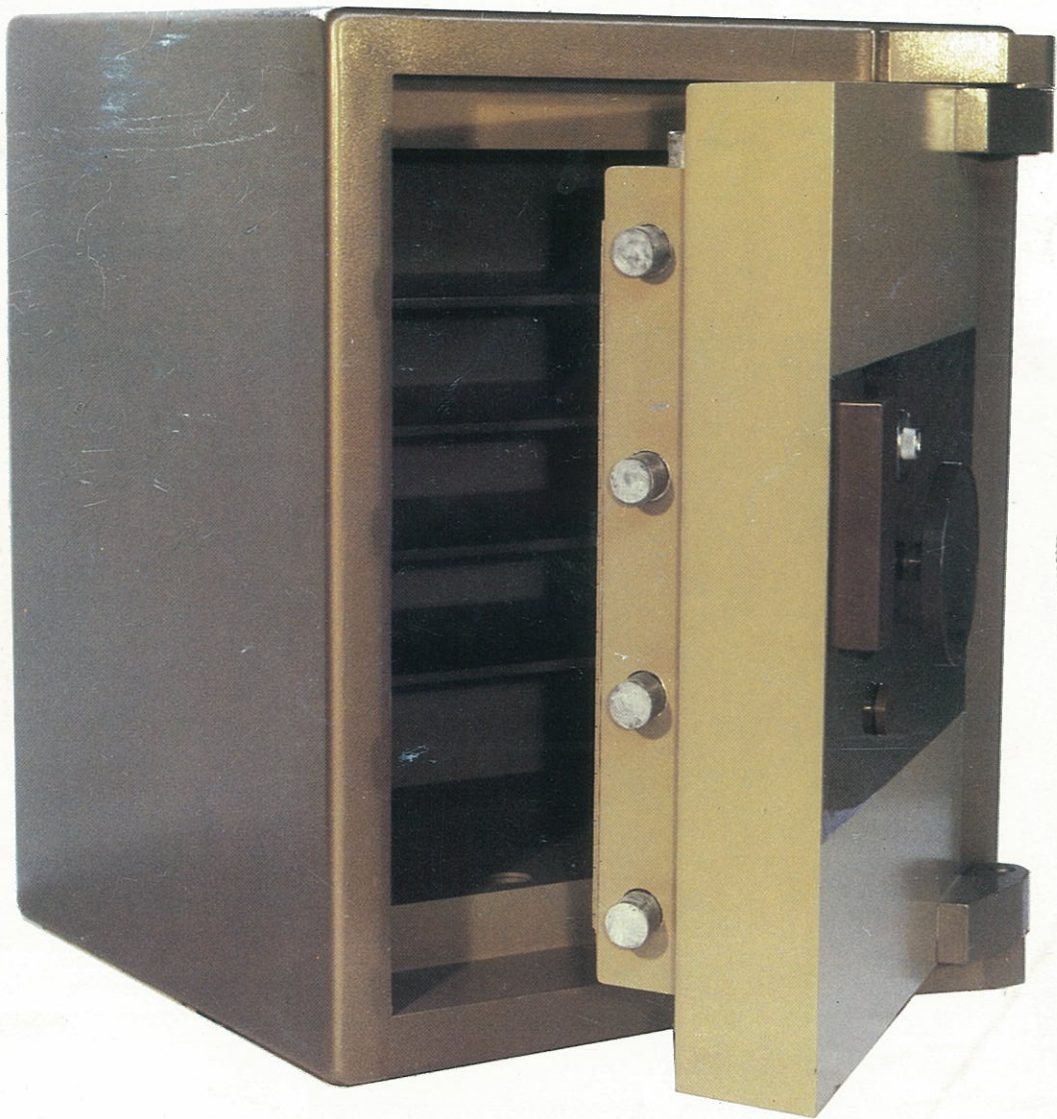
SLS Gem Anti-lance (US. UL. TXTL. 60) Unique six-sided protection against the Thermic Lance.