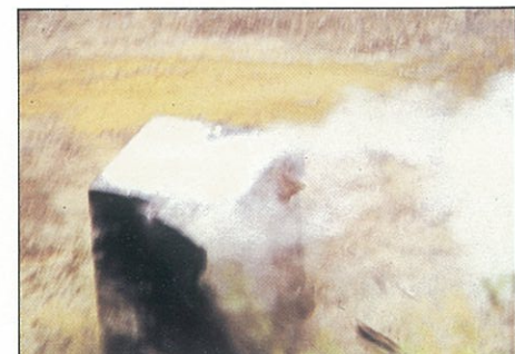
UL Explosive Testing