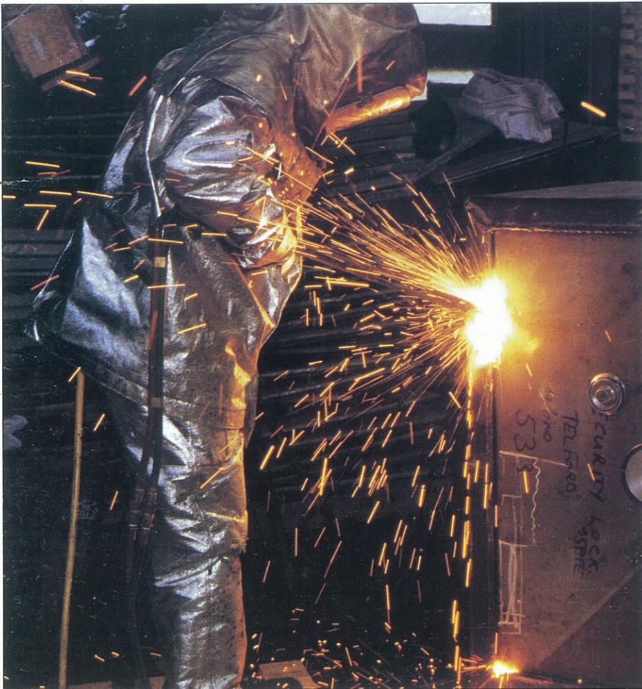
UL Torch/Tool Attack on Safe Door Jamb